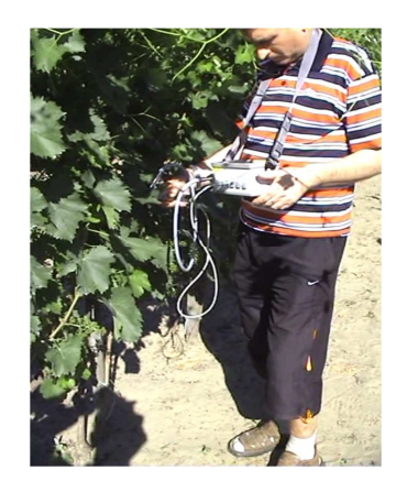
Figure 6: Dark adapted leaves and the measurement process