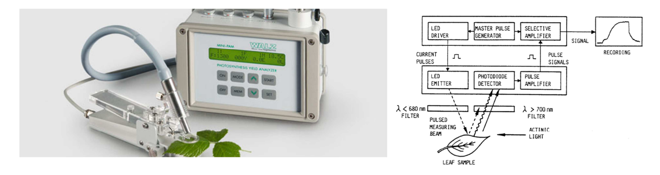
Figure 4: MINI-PAM Photosynthesis yield analyzer and the schematic view of the PAM measuring principle

The MINI-PAM, like all PAM Fluorometers, applies pulse-modulated measuring light for selective detection of chlorophyll fluorescence yield. Numerous studies with the previously introduced PAM Fluorometers have proven a close correlation between the thus determined YIELD-parameter ( \Delta F/Fm') and the effective quantum yield of photosynthesis in leaves, algae and isolated chloroplasts. With the help of the optional Leaf-Clip Holder 2030-B also the photosynthetic active radiation (PAR) can be determined at the site of fluorescence measurement, such that an apparent electron transport rate (ETR) is calculated. In addition to this central information, the MINI-PAM also provides the possibility of measuring fluorescence quenching coefficients (qP, qN, NPQ), applying continuous actinic light for measurement of induction curves (Kautsky-effect) and automatic recordings of light-saturation curves with quenching analysis.